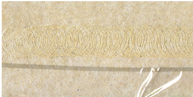
Hot melt adhesive spiral, interior of Pret a Manger wrap packaging, 2013

The glue ensuring the integrity of the pack is low migration UV flexo . This concerns the effort to eliminate the chance of substances migrating from the adhesive to the interior of the pack and the unthinkable consequences of interaction with the product. In the case of the wrap design variation, the hot melt glue linking carton sleeve with polypropylene jacket is applied as a miniature Twombly spiral (whether the elegance of the squirt has any effect on adhesive migration, I can't say). Incontinent glue, however, is not the only prospect of the inhabitant's freshness being compromised. The violently named phenomenon of aroma scalping is the removal of flavour components through absorption and adsorption-based losses to the packaging itself. Rest assured, though, with Pret we're talking DayFresh , and I can't imagine scalping rates are high enough for through-wall migration loss of aroma volatiles. As the tamper-evident custom label says,