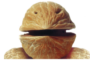
Armando Testa Nocero Umbro 1991