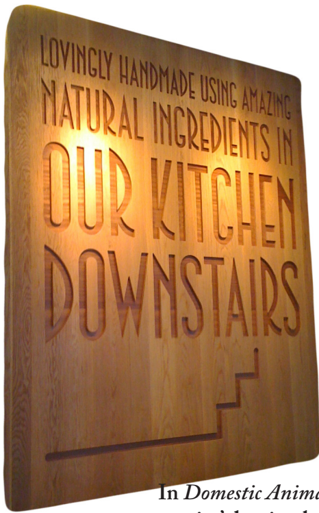
Routed plaque, Pret a Manger, London

In Domestic Animals , Branzi says the 'metropolis of objects' has cloned 'human and animal species', leaving humans to sit comfortably in the stalls while a system of objects play 'the leading role in the tragedy'. Go to a Pret and this is overwhelmingly apparent. An ecology of sandwiches and their well-photographed dreams could do quite nicely without us. His notes on the modern retail environment – to his mind "sets...in which an ambient story is staged...specialized places, with a highly religious character" – sound like Pret Ah Maw(n)-Jzay to me. In the scene-setting of the Pret shop, every surface, every whisper on a serviette is carefully mannered, sermons in Paleface Palatino piously intoned in routed hardwood panels. Most otherworldly is the Petit Pret located in King's Cross, squeezed in a limbo-floor amidst the Oyster card machines, the adjacent escalators descending to the Underworld Underground. Why Pret particularly? They are ahead of the pack in lacing their products with 'a sliver of mystery'. Their cartons belong in Branzi's category of objects with soul, beloved of man;