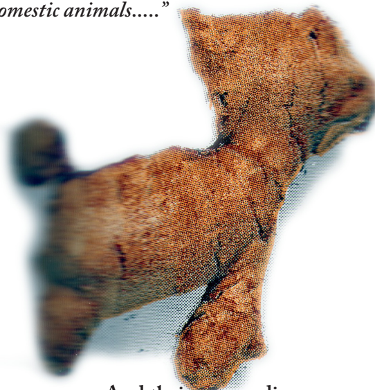
Jörgen Ahlström Ginger Beer Dog c.2010

And their extraordinary propagation in London makes Pret cartons a 'solid and far-reaching presence', a 'screen and substitute for man himself'.