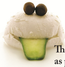
Jörgen Ahlström Frog for Pret a Manger 2012

This vein of activity, the readiness of a metropolitan public to embrace lunch rendered as personality-fauna, stands not just for the incontrovertible freshness of Pret's ingredients but also an irresistible joi de vivre with the charisma of brilliant design and the open-hearted purity of a toddler's picture-book. I'm inclined to read this not as a willingness to be infantilised but as a disposition to culinary animism. Maybe, though, blueberry eyes and gherkin tongue for a ball of mozzarella are just the training wheels for such an outlook. Maybe the un-sculpted sandwiches needn't be endowed with features to have a voice. Gazing at the various fillings in their serried cells cartons on the shelves, I sense beings remote and fated. If the carton wedge resembles an open casket, we can reasonably conclude they ferry souls. If limbo's in the refrigerator, the hot cupboard must be hell (the mortuary to cremation).