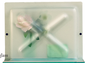
Andrea Branzi TX 0204 From the series Blister Moulded plastic with magnetic closing, transparent glass 2004