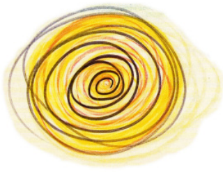
Federico Fellini A sun from the Book of Dreams

For my part, the honorific housing of sandwiches suggests another sort of perishable. 'Brittle, evanescent things', Fellini's Night Work . In his assiduously kept ledgers, Fellini ensured his florid creative nourishment remained eternally fresh by capturing it with experienced cartoonist's verve on waking. Committing fleeting visions to paper in febrile, classroom colours is an act of preservation akin to sealing them in a Modified Atmosphere Package. Letting his leaves continue to transpire, delaying signs of senescence. The pages yellow, but the mysteries endure.