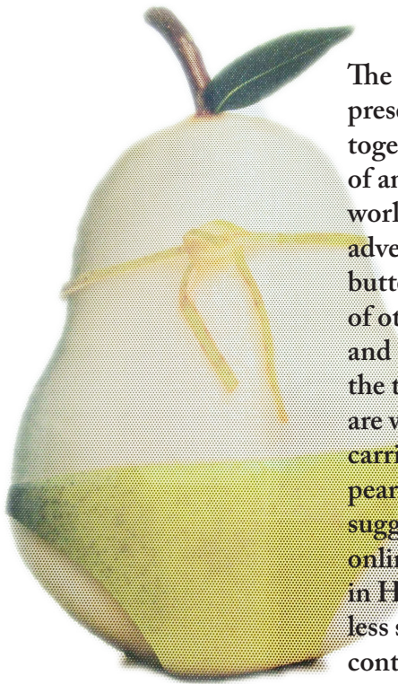
Jörgen Ahlström Don't be shy for Pret a Manger 2013

The routinely jettisoned sandwich carton has an inscrutable presence. Little prisons for a little something to keep body and soul together; it seems quite possible these vessels deal in some variety of animism. Pret a Manger frequently invokes a kind of spirit-world germinating from their fresh ingredients with their in-store advertising tableaux confecting teapots from fennel and chilli, butterflies from radicchio and asparagus, and a whole menagerie of other friends. Hitting a note of informal, dining table invention and eyelash-fluttering twee, photographer Jörgen Ahlström carries the torch for Armando Testa's fun with food. These pleasantries are well-pitched; tourists have delighted in the 'Don't be shy' vinyl carried throughout its London outlets this summer, in which a pear's skin has been daintily scalpel-ed away, leaving slivers that suggest bikini briefs. Chirps of approval are easily sounded out online, too; the fennel-chilli teapot inspired a blog from someone in Hong Kong. An expat in London found that Pret UK catered less satisfactorily to a stateside palate, but, powerless to resist contemporary Arcimboldo-ism, continued to patronise the chain nonetheless.