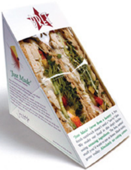
Rapid Action Packaging Pret a Manger – DayFresh Carton Wedge Various iterations since 1997

Familiarising myself with the vicissitudes of carton packaging with a view to working in the form, I developed a unexpected appetite for technical data sheets and their detailed breakdown of the products' micro-qualities. As with anything, I suppose, you dip your toes in and find a subject wreathed in evocative jargon. Curious epithets sprouting elemental poetry – windows, mists, protection and freshness – are sown throughout these texts that one might unfairly presume drily opaque. Coffin production, for sure, would also have attendant technologies giving the lay-artist pause for wonder. For now, I am concerned with the sandwich carton; specifically the originators of the carton wedge, the first company to hermetically seal the carton tray, charismatic folk at the frontier of the packaging world, Rapid Action Packaging, who have supplied Pret since 1997.