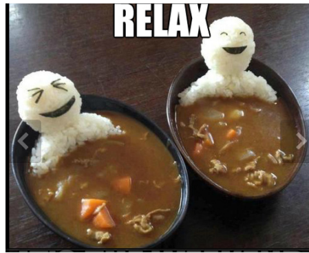
Unknown Pret a Manger Twitter contributor Relax it's the weekend Early 2013