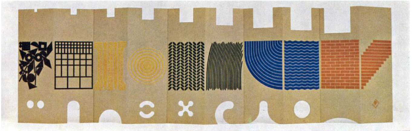
Enzo Mari Il posto dei giochi 1967 Folding corrugated card screen with prints

Where the Place of games displays pure keys releasing associative wafts of play, a zone unhampered by serrated lines or malice, the Pret sandwich cartons' grocery fetishes hint at an arcadian realm of noble sustenance, the self-effacing haikus of text a land of inviolable principles. Place of games encourages bambini to arrange their own space. Stretch the Pret carton to bambino dimensions and you have a stylisation of a dwelling-place sure to get an infant's attention.